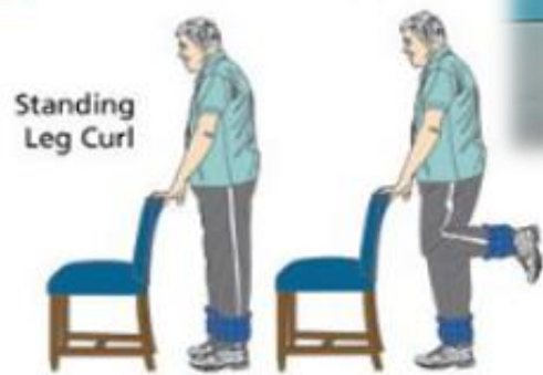
Standing Leg Curl