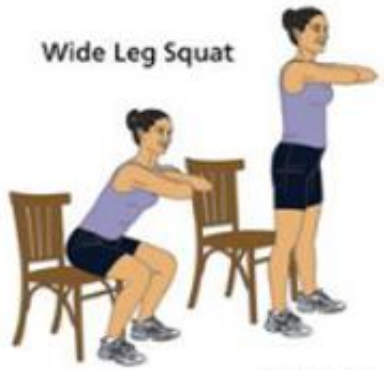
Wide Leg Squat