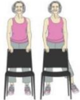
Side Leg Raise