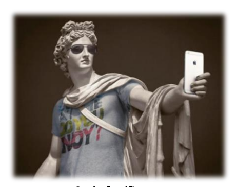
God of selfies...

Independent - Gen Xers are self-sufficient, resourceful, and individualistic since they have been accustomed to caring for themselves since before reaching adulthood. They value freedom and responsibility and try to overcome challenges on their own.